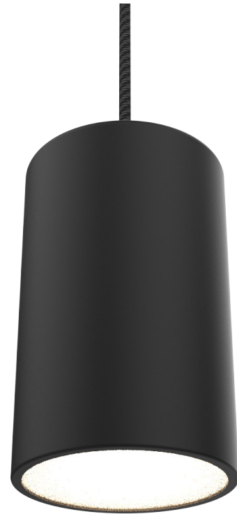
Shown here in Black (BL)