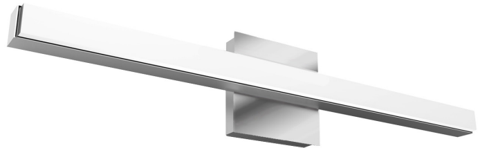
(Shown in Polished Chrome with two-piece Shallow Backplate)

See page 2 for finish and backplate options.