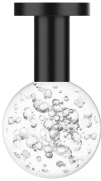
SP2 CANOPY MOUNTING OPTION (DRIVER SOLD SEPARATELY)