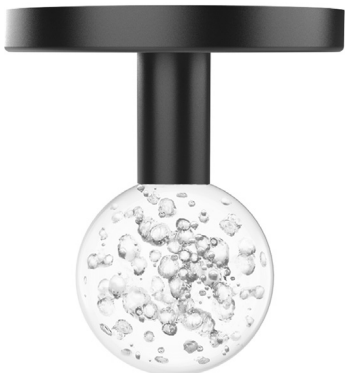
SP5 CANOPY MOUNTING OPTION (INTEGRATED DRIVER)