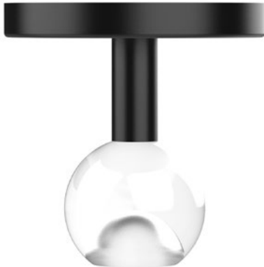
SP5 CANOPY MOUNTING OPTION (INTEGRATED DRIVER)