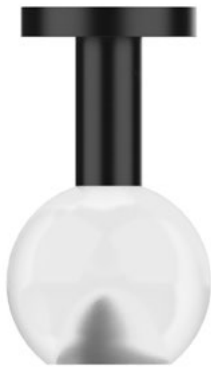
SP2 CANOPY MOUNTING OPTION (DRIVER SOLD SEPARATELY)