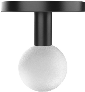
SP5 CANOPY MOUNTING OPTION (INTEGRATED DRIVER)