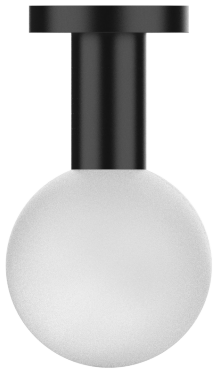
SP2 CANOPY MOUNTING OPTION (DRIVER SOLD SEPARATELY)